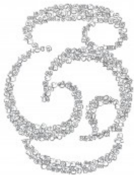
Language equality is essential for a peaceful country and a just society.

http://twolanguages.files.wordpress.com/2010/06/flag-e.jpg