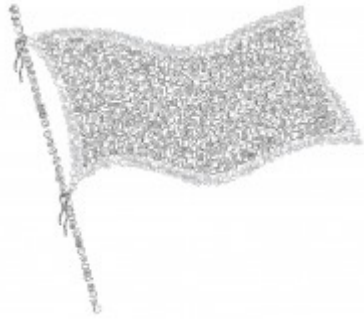
Language equality is essential for a peaceful country and a just society.

http://twolanguages.files.wordpress.com/2010/06/flag-e.jpg